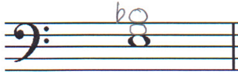
17. Diminished triad

Use the musical example in each box to answer the questions.