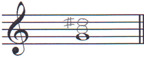
16. Augmented triad

Draw the triad in root position ABOVE the note. Use whole notes. Use accidentals as needed.