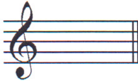
20. D Major