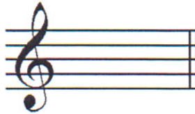
19. A Major