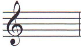
21. C Major