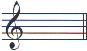
18. G Major