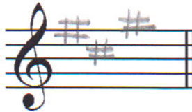
19. A Major