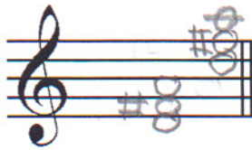
20. D Major