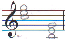
21. C Major