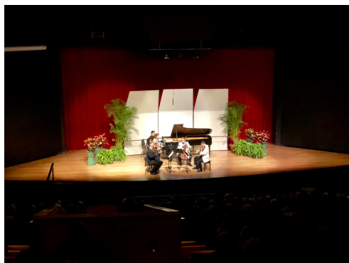
Chamber Music Festival

https://osugiving.com/mcknightcenter/news/Chamber-Music-Festival