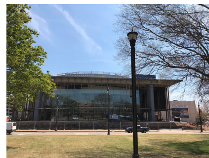
Construction of the new McKnight Performing Arts Center, to open in fall 2019