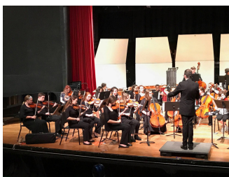
OSU Summer Music Camp