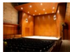
Construction progress on OSU McKnight Center for the Performing Arts Music Halls

The annual OSU High School Piano Competition will take place on Saturday, February 15, 2020. More information will be sent closer to that date, but the application deadline will likely be approximately 2 weeks before the competition. Please encourage your talented students to enter!