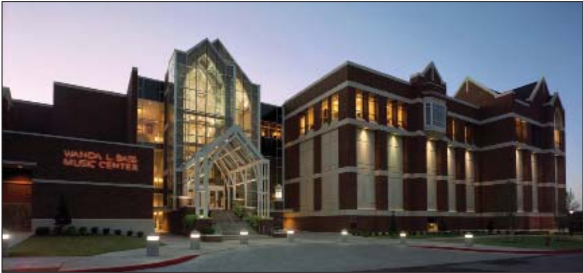
THE WANDA L. BASS MUSIC CENTER AT OKLAHOMA CITY UNIVERSITY SITE OF THE 2012 OMTA CONFERENCE

Type in and print all your audition and competition forms! Go to: http://oklahomamta.org/forms-directory.html