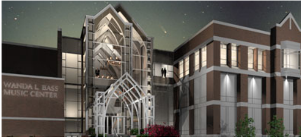
The Wanda L Bass Music Center at Oklahoma City University.

Highlights of the conference include excellent convenient facilities at the Wanda L. Bass Center of Oklahoma City University. All meals are sit-down affairs this year in the beautiful Atrium.