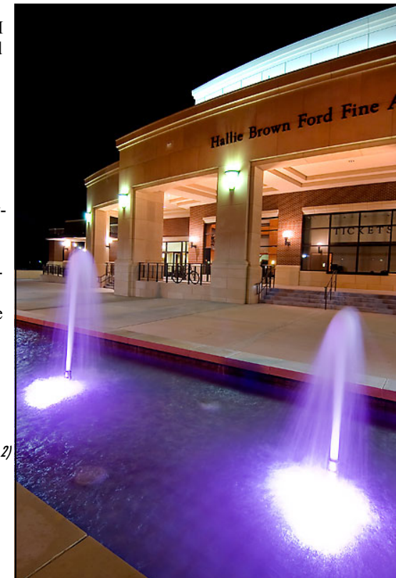
THE HALLIE BROWN FORD CENTER AT EAST CENTRAL UNIVERSITY